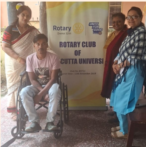
Wheel Chair Distribution