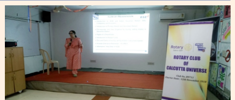
Financial Literacy programme