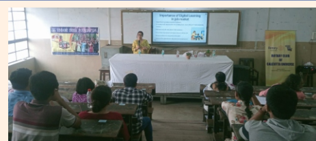
Digital Literacy Program