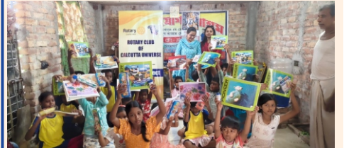
Basic Education and Literacy