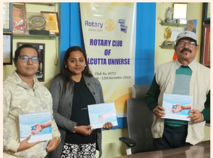
Promoting Rotary through Desk Calender Distribution