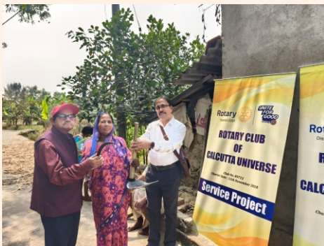
Support for Farmers