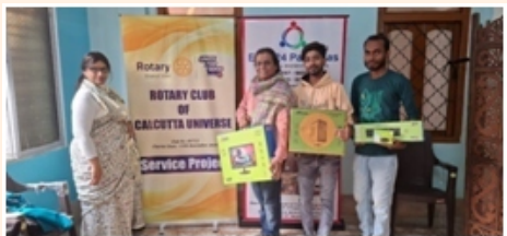
Computer Literacy for Transgender Community