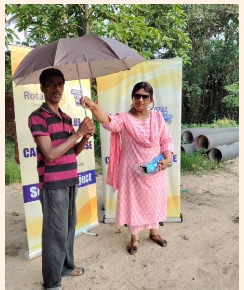
Protection Against Heat wave Through Distribution of ORS, Drinking Water and Umbrella