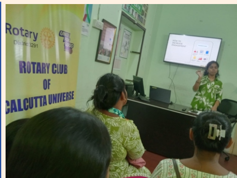
Digital Literacy Up Skilling Program

Through its diverse and impactful service projects, the Rotary Club of Calcutta Universe continues to uphold the spirit of "Service Above Self." The Club's commitment toward environmental sustainability, healthcare, education, livelihood generation, and social inclusion has positively transformed the lives of numerous individuals and communities, especially those belonging to vulnerable and marginalized sections of society.