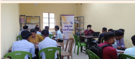
Arranging Job Fair