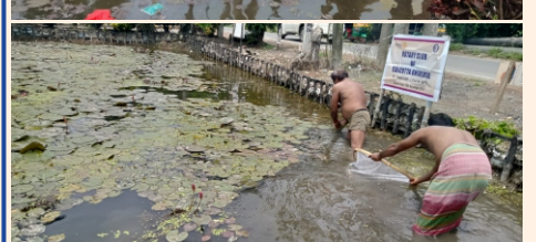
Reviving Road Side Ponds