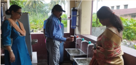
Installation of Drinking water Filtration Units in School and College