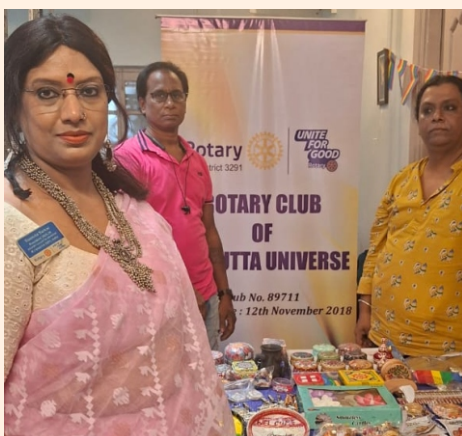
Exhibition for Self Help Group