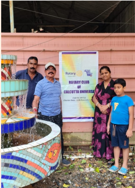
Iron removal Treatment Plant (IRTP) in Housing Complex