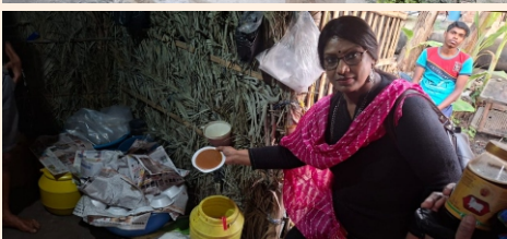
Promoting Palm Jaggery Makers