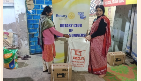
Setting up of Stitching Hub