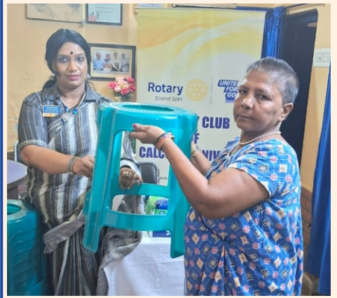
Plastic Commode, Adult Diaper and Sanitary Napkin Distribution