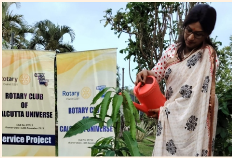
Sapling Plantation Drive